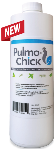
500 ml Bottle